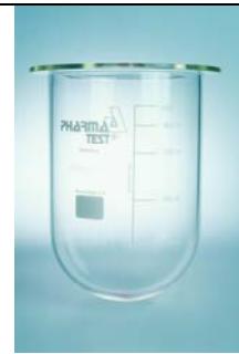
USP glass vessel incl. code # 303-5225 (1 litre) # 303-5221 (2 litre) # 302-5621 (4 litre)