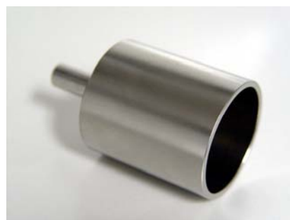
TC transdermal Cylinder incl. Adapter (USP/EP App.6) # 316-0230