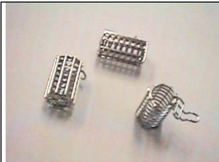
Sinkers jap. PHC # 302-9000