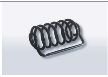
Sinker PTFE coated 6 windings L22.9x9,4 mm # 302-9061-6