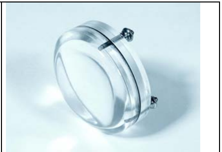
EP Extraction Cell, perspex # 303-1005