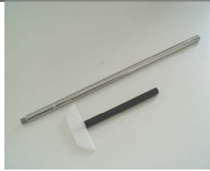
st.st. Stirring Shaft # 316-0116-6 Ctd. Paddle Adapter # 316-0250-6