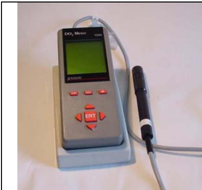
DO 2 Meter # 38-31500