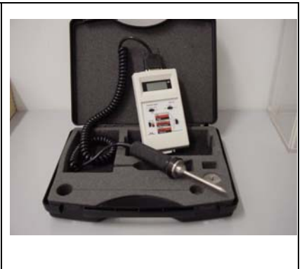
Vibration Meter - VM # 32-30511