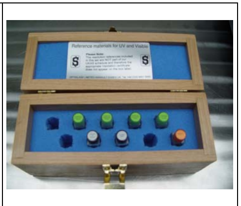
Spectrophotometer Calibration Reference Cuvettes # 350-2110