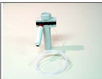
Flange Kit for PTFE Tubing # 30-31050

We reserve the right to make technical changes without any prior notice