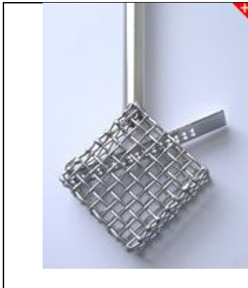
FELOPINE Baseket # 303-3035