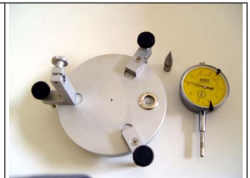
SWT 2 shaft wobble + centricity tester # 30-31210