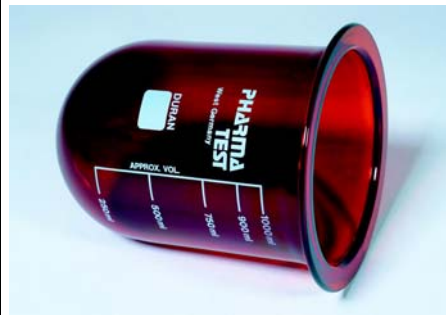
USP amber coloured vessel incl code # 303-5425 (1 litre) # 303-5222 (2 litre) # 302-5622 (4 litre)