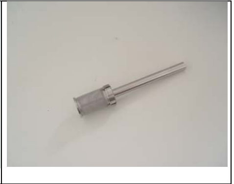
st.st Basket Adapter complete # 316-0220-6