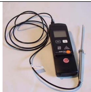
digital Thermometer # 30-31007