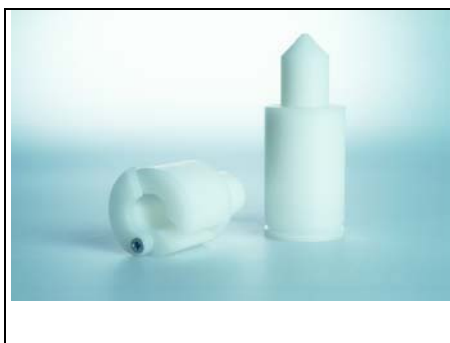
Height and Depth Gauge # 302-9001 (paddle) # 302-9002 (basket)