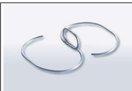
stainl. steel Wire Sinker # 302-9065-6