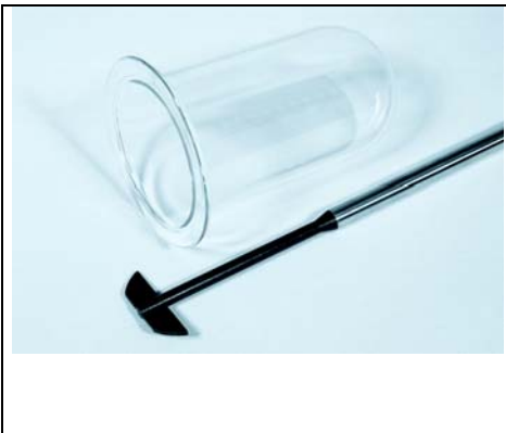
mini vessel assembly, 250 ml # 303-5100-6