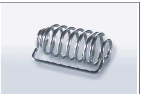
st.st. Sinker 6 windings, approx. L22.9x9.4mm # 302-9051-6 L25.4x14.6mm # 302-9053-6