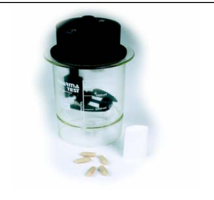
PTSW 0 Suppository Dialysis Cell # 39-00502