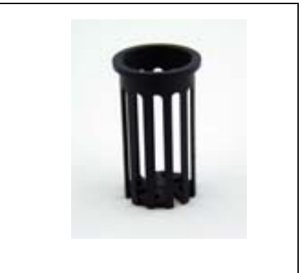
Suppository Dissolution Basket # 311-3000-6

PHARMA TEST GmbH Siemensstrasse 5 D-63512 Hainburg (GER)