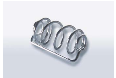
st.st. Sinker, 4 windings, approx. L26x9.7 mm # 302-9050-6