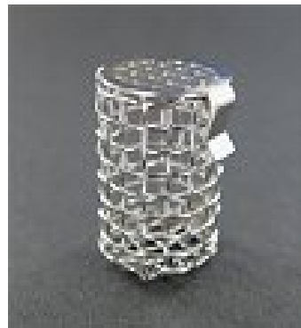
st.st. Sinker Basket for capsules 8 mesh (approx.) L=25x12mm # 302-9066-6 L26x9.7mm # 302-9050-6