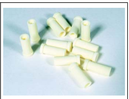
5 or 10 micron PP Sinter Filter # 31-63211-50 (10 µm) # 31-63511-50 (5 µm)

PHARMA TEST GmbH Siemensstrasse 5 D-63512 Hainburg (GER)