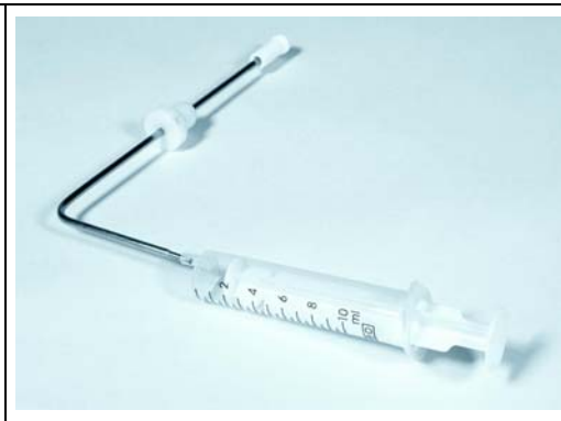
Manual sampling probe # 303-0100