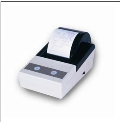
DL1 Data-Logger for DT70 + DT8 + PTB301/302 # 30-30600