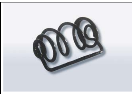
Sinker PTFE coated 4 windings L26x9,7 mm # 302-9060-6 L33.5x10.4mm # 302-9062-6