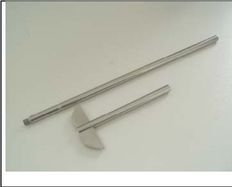
st.st. Stirring Shaft # 316-0116-6 st.st. Paddle Adapter # 316-0210-6