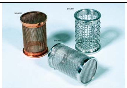
40 mesh Gold pl. Basket # 311-2800 10 mesh st.st. # 311-2804 40 mesh st.st. # 311-2801-6 100 mesh st.st # 311-2803-6

PHARMA TEST GmbH Siemensstrasse 5 D-63512 Hainburg (GER)