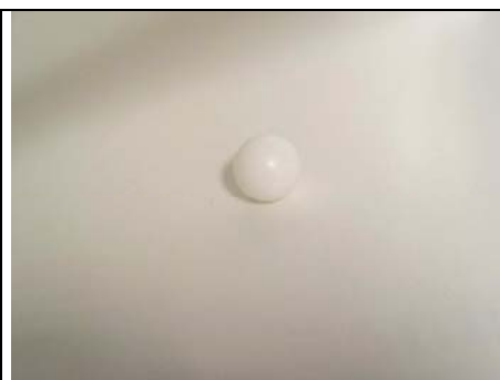
Depth Ball 25 mm # 315-0200