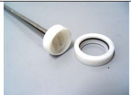
Ointment and Suppository rotary Cell # 303-1015