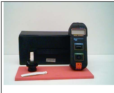
digital Tachometer, Handy # 30-31006